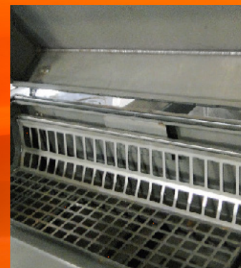
Parts Process Basket